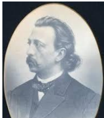
Wisconsin Governor Edward Salomon